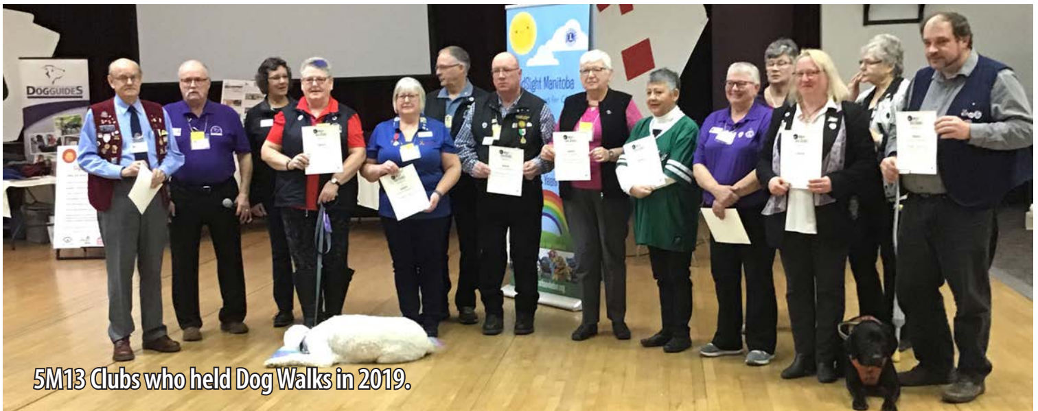
5M13 Clubs who held Dog Walks in 2019.