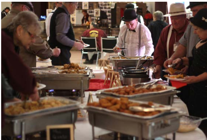
Excellent food service from Russell Chicken Chef