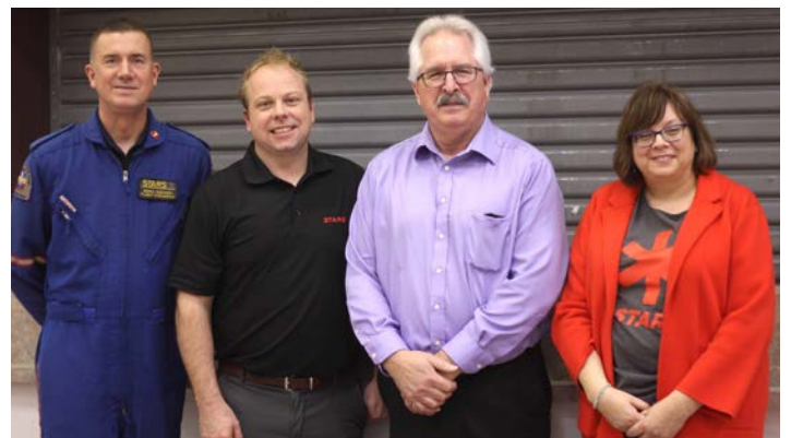
STARS Air Ambulance and VIP (Very Important Patient)