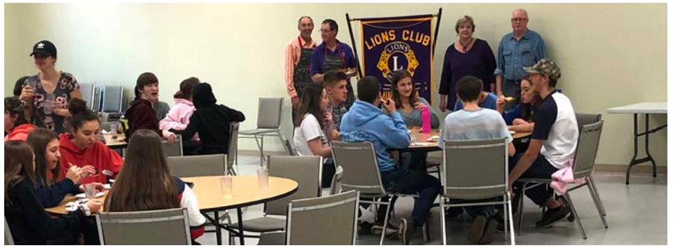
Minnedosa Lions Club join in the Community Support of the Westman Youth Choir by preparing and serving supper to 53 youth and 7 chaperones on Saturday, October 18.